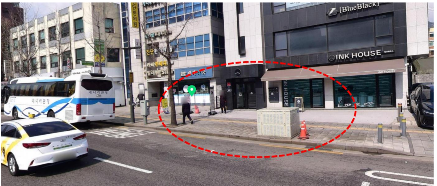
<Location of Shuttle bus stop >

Travel time: About 30 minutes - Position and directions from Google Maps